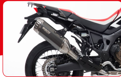
BOS DESERTFOX CARBON STEEL € 799,-*