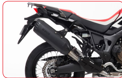
BOS DESERTFOX BLACK COATED € 879,-*