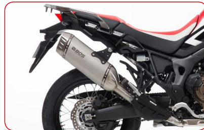
BOS DESERTFOX SHOT BLASTED € 799,-*